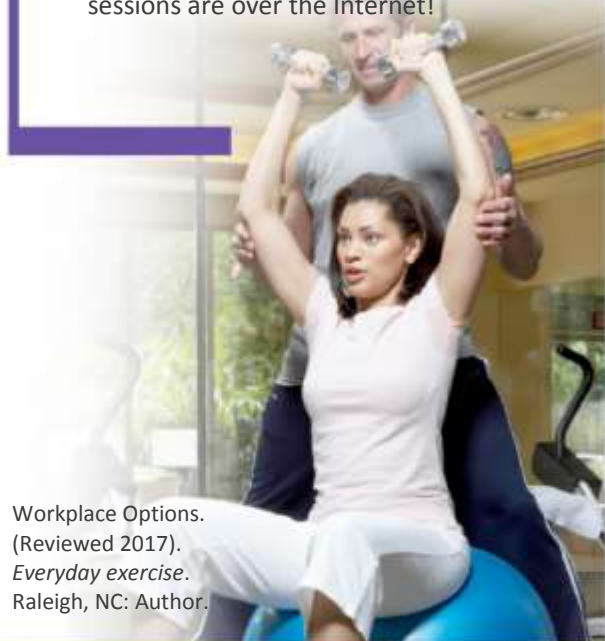
Workplace Options. (Reviewed 2017). Everyday exercise. Raleigh, NC: Author.